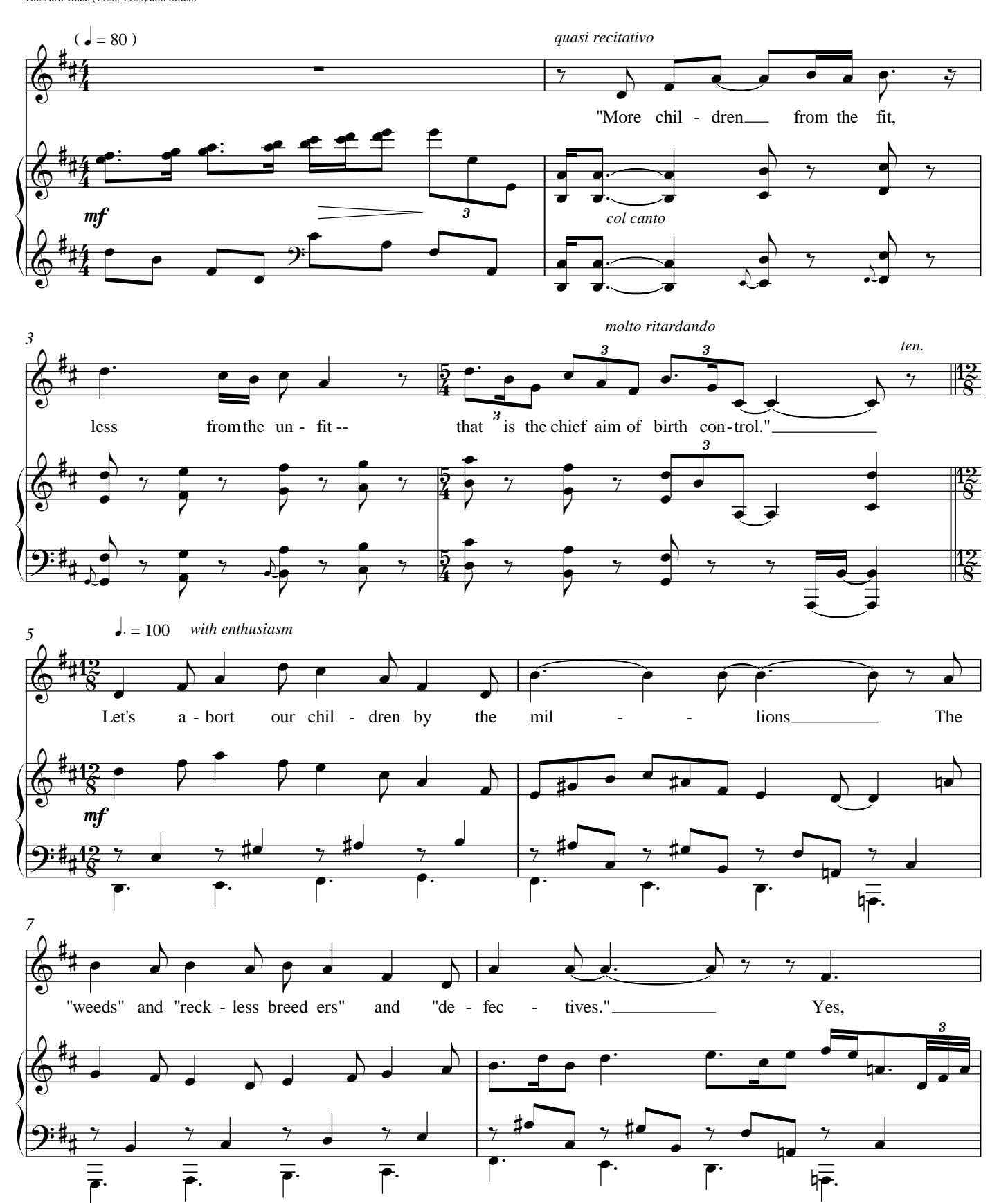
Copyright © 2006 Gary Bachlund (BMI), Monrovia. All international rights reserved.

Margaret Sanger (1879-1966) Quotes drawn from The Woman Rebel (1914), Birth Control Review (1919, 1920) The New Race (1920, 1923) and others